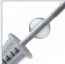
Spec+ Medical Balloons