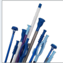
Spec+ Additive Manufacturing