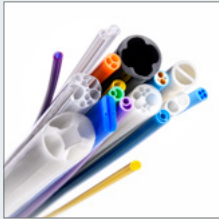
Spec+ Precision Extrusion

Our most cutting-edge technologies. The truly innovative solutions that differentiate Spectrum from other medical device manufacturers.