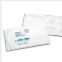
Spec+ Tyvek® Packaging