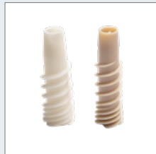
Spec+ Bioresorbable Components